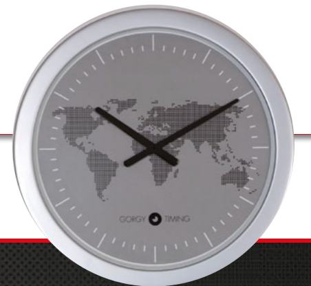
HANDI 450 world face