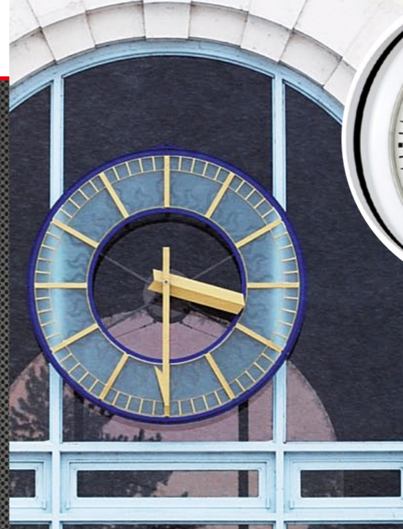
Auxerre Station Clock

** Contact our sales team for a personalized project.