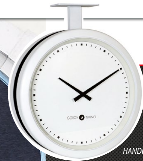
HANDI 450 double face